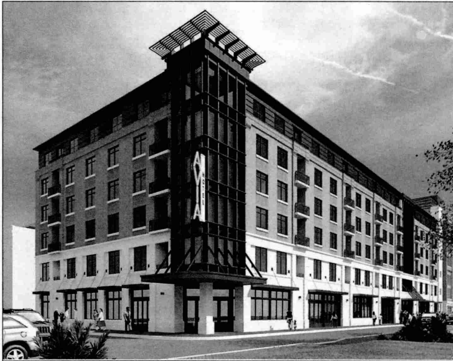
The six-story AVIA Savannah overlooks the soon-to-be-restored Ellis Square in the heart of the historic district